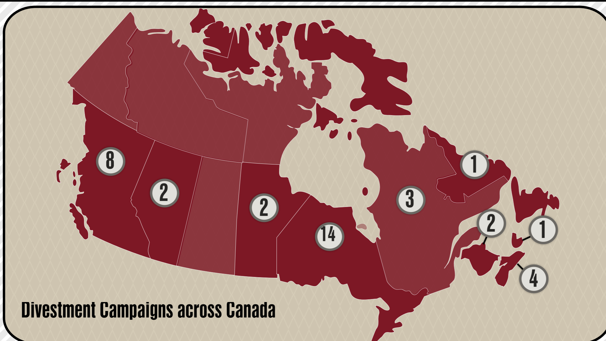
Divestment Campaigns across Canada

8.8% of the operating budget of 835 surveyed U.S. colleges and universities came from their endowment funds in 2013