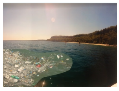
Student Protest Art

challenge, helped students make connections about how sustainable forms of leisure activities improve physical and mental health.