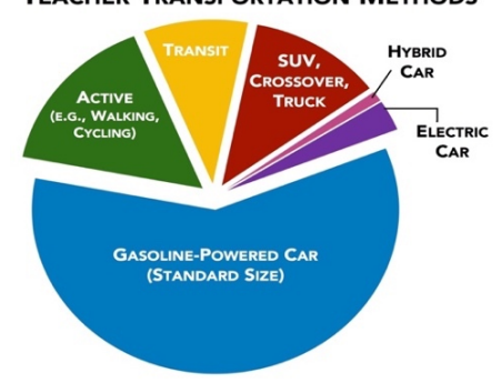
Transportation Survey Results

Zero Emissions Day illustrates how transportation choices directly translate into emissions reductions. The school plans to use the event to encourage reflection on more meaningful actions their school community could take. The Getting Climate-Ready guide links health and well-being which climate action practices. Other potential benefits from Zero Emissions Day include reduced stress from working at home and quieter work conditions. Overall, Zero Emissions Day illustrates the power of thinking differently about climate change education by engaging with technology in unique ways. Zero Emissions Day is also a beautiful example of how schools can collaborate together in the spirit of climate action!