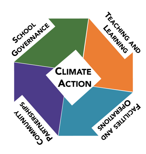
SCHOOL CULTURE OF SUSTAINABILITY