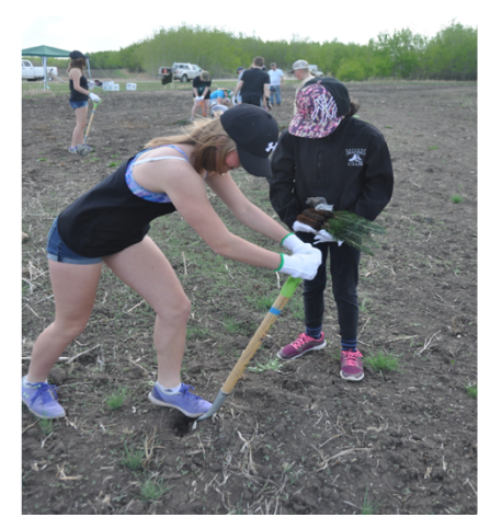
Planting Trees at the Local Waste Management Site

At Hafford Central school, students learn about climate action mostly due to formal curriculum requirements in science, social studies, and English classes. As many students come from farm families, topics such as the benefits of using fewer chemicals and crop rotation instead of fertilizer are often covered. Courses at the school also include Indigenous perspectives in science and social studies. In 2017-2018, the school had a special focus on waste reduction in their classes. The school's UNESCO facilitator went to every class and sorted a day's worth of trash in front of students to provide them with a concrete example of proper waste management. Students were also taught that recycling means less resources are taken from the environment to make new materials, a lesson which was also linked to oil production and tree harvesting.