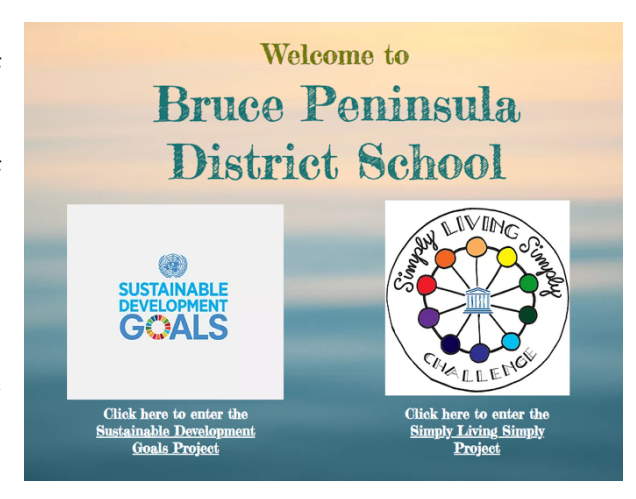
The Simply Living Simply Website Homepage

Implementing Simply Living Simply was made easier due to the well-established culture of sustainability at Bruce Peninsula District School. The school's status as an Ontario EcoSchool also supported implementation of certain activities, for example, through existing audit templates. The school's partnership with the Bruce Peninsula Environment Group, and close proximity to a biosphere and national park has also supported climate actions. The school's work on reconciliation has made it easier to connect climate action to Indigenous perspectives. All in all, the project generated excitement as the school community worked together on climate action.