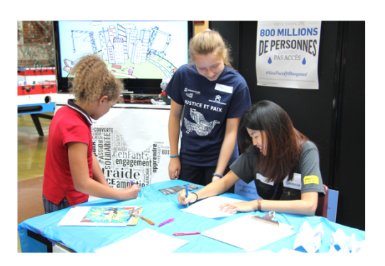
Student Committee Members Raising Awareness of Climate Issues

This initiative is also supported by partnerships with organizations outside of the school. In particular, the school partnered with the "unis" movement, which encourages people to take action on social and environmental issues and to inspire others to also take action. Due to this partnership, the school also had a unis committee, which organized a march for water. Issues related to water have been particularly salient for some students at Collège Durocher Saint-Lambert, as the city's water tank has potability issues. The school has used this local example to raise awareness that not everyone has access to clean water.